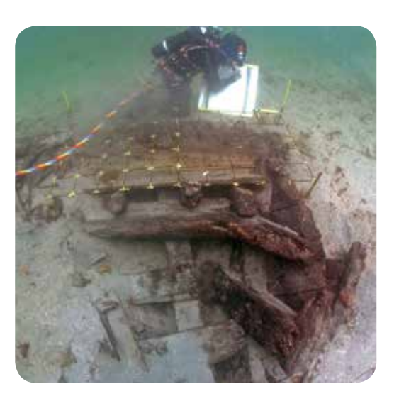
Possible Spanish wreck, Rutland Isalnd, Co. Donegal: 16th - 17th Century AD.

the public through the Archive Unit. The UAU also liaises with the Geological Survey of Ireland (GSI) on its work on the Irish National Seabed Survey (INSS) and with the GSI and the Marine Institute on their joint INFOMAR project - Integrated Mapping For the Sustainable Development of Ireland's Marine Resource - by assisting with the identification of shipwrecks and underwater sites.