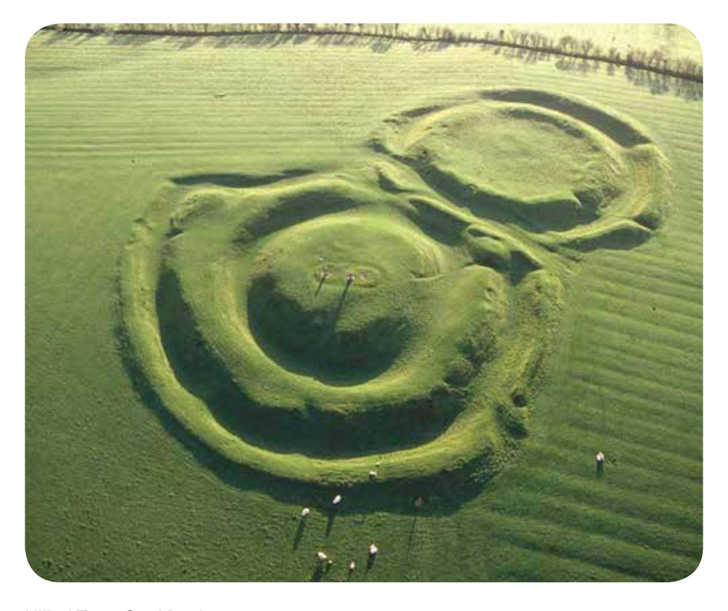
Hill of Tara, Co. Meath

The NMS Archive consists of an extensive body of material relating to the archaeological heritage of the State. The main collections is made up of Sites and Monuments Records (SMR) reports on some 150,000 archaeological sites within the State; excavation reports on the results of licensed excavations; reports and sources on underwater archaeological sites, including the Historic Shipwreck Archive, information on islands, ports and harbours and an extensive photographic collection of almost 500,000 images of monuments. The Archive records may be consulted by appointment by emailing <a href="mailto:nmarchive@ahg.gov.ie">nmarchive@ahg.gov.ie</a>