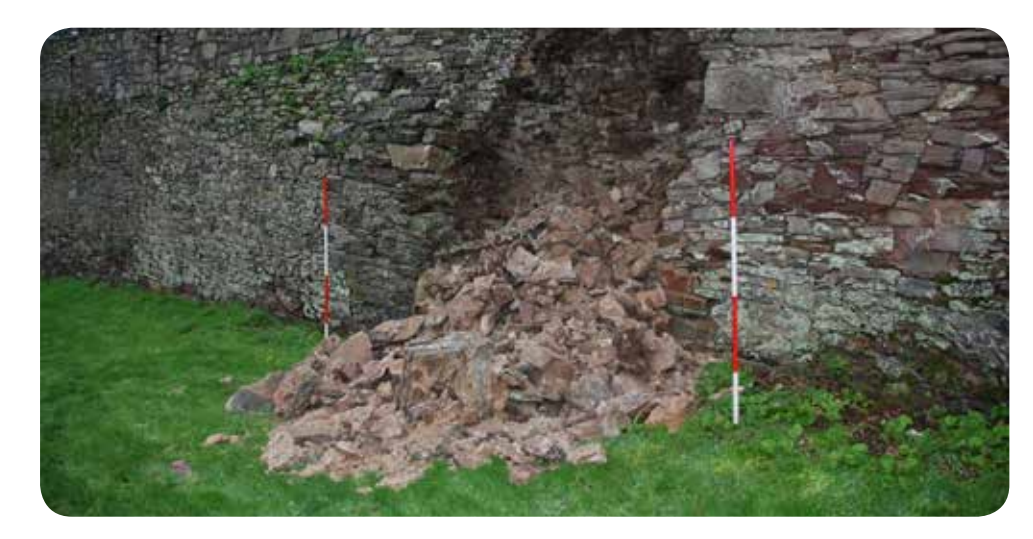
Collapse of town wall, Co. Cork (requiring ministerial consent)

The Planning and Licensing Unit endeavours to ensure that developmental impacts on archaeological heritage are avoided or reduced. Where this is not possible, archaeological remains are preserved by record, i.e. through archaeological excavation and scientific recording of all features and deposits identified.