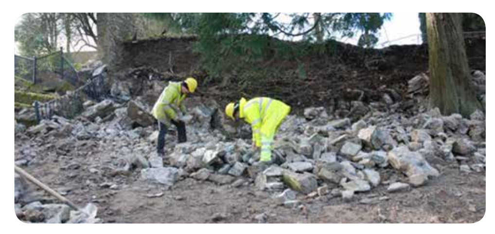
Repair works at collapse of graveyard wall, Co. Cork

Anyone wishing to report possible damage to a monument or proposing to undertake work at or in relation to a monument should contact the National Monuments Service by phoning 01-631 3800 or e-mailing <a href="mailto:nationalmonuments@ahg.gov.ie">nationalmonuments@ahg.gov.ie</a>