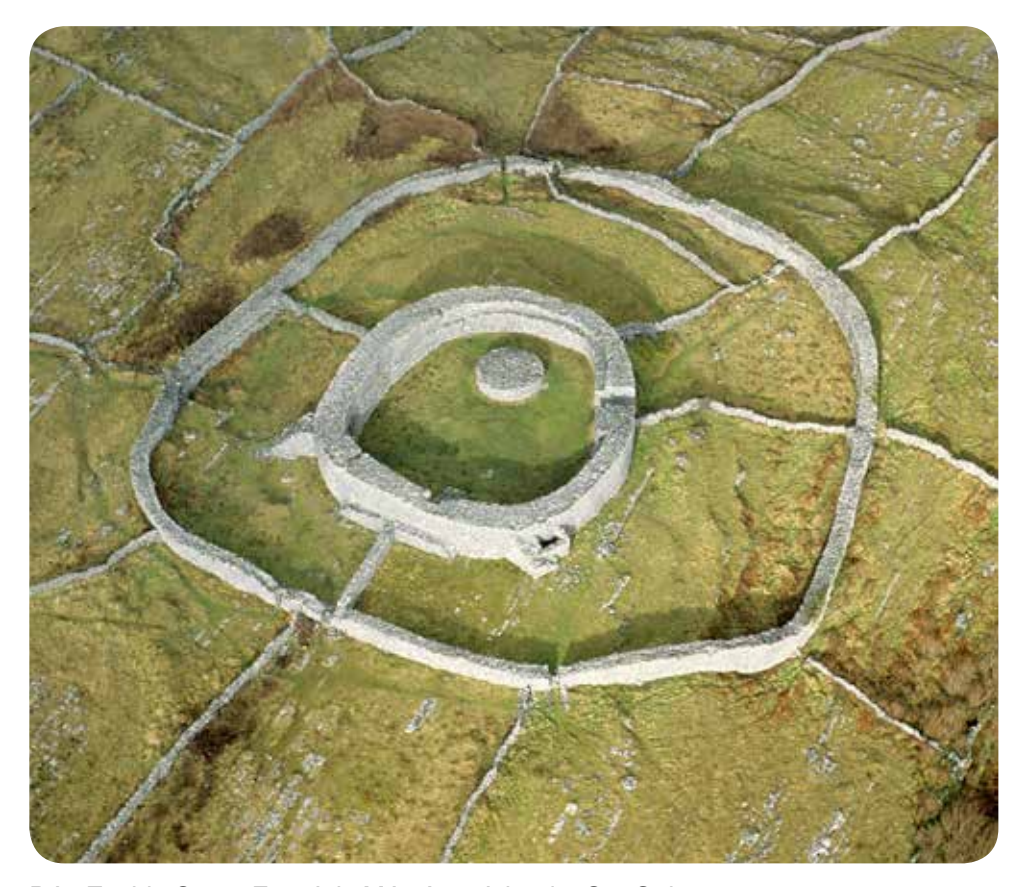
Dún Eochla Stone Fort, Inis Mór, Aran Islands, Co. Galway