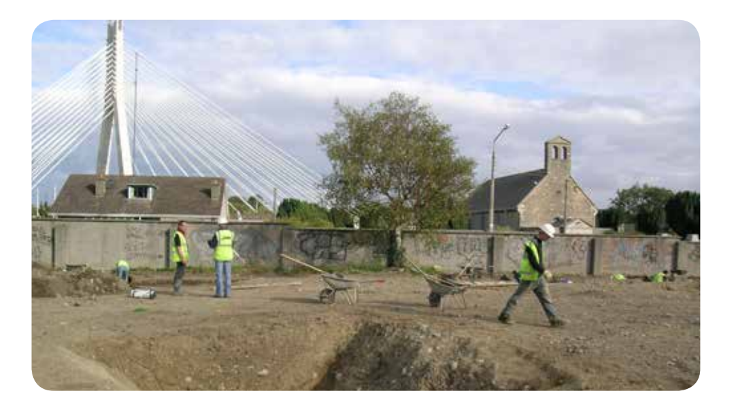
Excavation at Churchtown Upper, Dundrum, Co. Dublin

The Planning and Licensing Unit provides input and advice on archaeological heritage protection to planning and other authorities in relation to individual planning and other development applications, projects and plans. The Unit also gives archaeological advice to community groups, companies and agencies on projects in areas such as tourism, agriculture, forestry, peat extraction, graveyard maintenance and the Rural Development (LEADER) Programme.