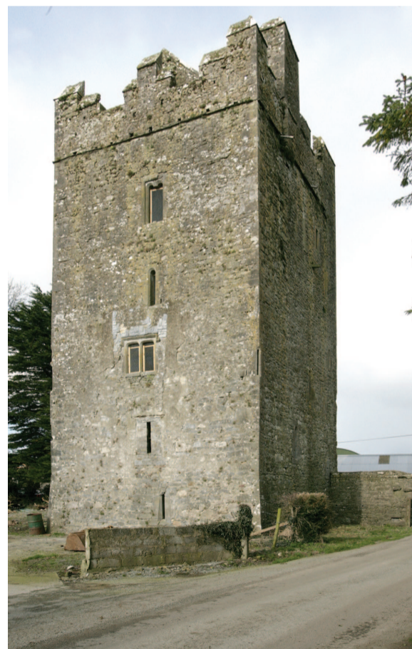
CLOCKWISE FROM ABOVE: Dunsoghly Castle, Co Dublin; Aerial view of Pallas Castle, Co Galway, showing the large bawn; Clara Castle, Co Kilkenny.

O'Driscolls in Munster, like many other Gaelic lord families, all built and lived in tower houses, just as those of Norman descent did, such as Fitzgeralds, Butlers, Roches, Burkes and Walshes.